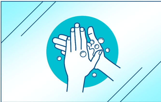
Rub hands together