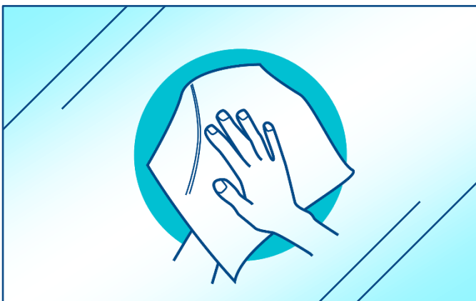
Dry your hands