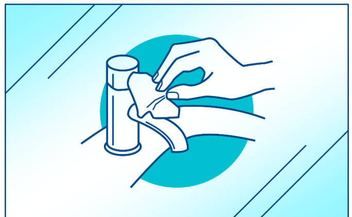
Turn off taps with paper towel