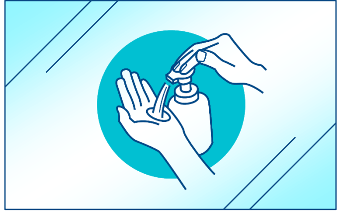
Apply plain soap